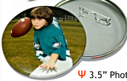
\Psi 3.5" Photo Button