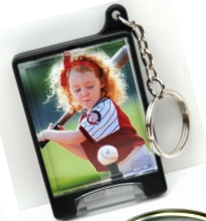
\Omega Photo Keychain w/Flashlight (incl. 1 photo)