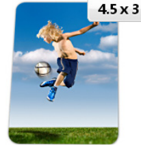
1 - Photo Magnet (die-cut, rounded corners)