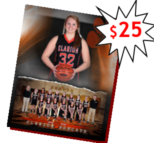
\times Team/Single Combo (for example only)