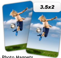
\Delta 2 - Photo Magnets (die-cut, rounded corners)